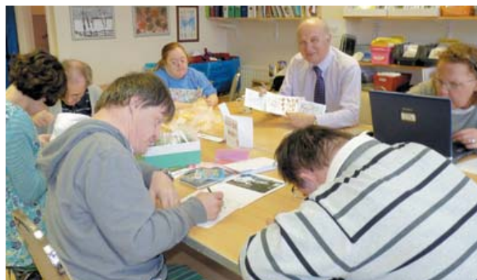
MP Vince Cable on a visit to Stepping on Out, where he spent time helping and talking to the group about their work and business.

Please support them by ordering from those illustrated on their web site at www.SteppingonOut.org.uk Also available from local stockists including Café Sunshine, Twickenham Riverside, the foyer of RichmondAid, 4 Waldegrave Road, Teddington or their new shop Stepping on Out, 7 The Causeway, Teddington, open Monday, Wednesday and Friday from 10am to 4.30pm, 0208 977 8042.