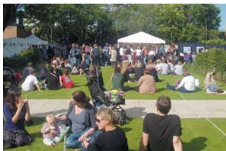
Opening of the Diamond Jubilee Gardens