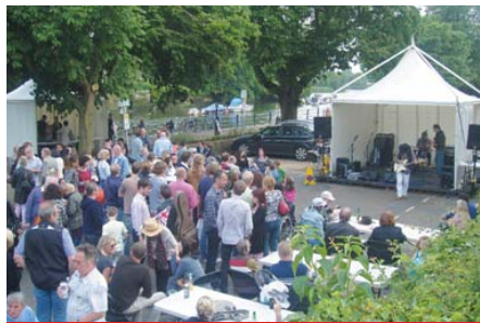
Riverside music at Twickenham Festival 2012