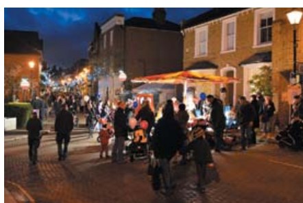
Christmas in Twickenham's Church Street

It's been a busy time for the Twickenham Town Business Association (TTBA) over the past six months, with the Twickenham Riverside Jubilee Festival, the Olympic cycling road races and time trials finishing off with a number of well attended and fun Christmas events.