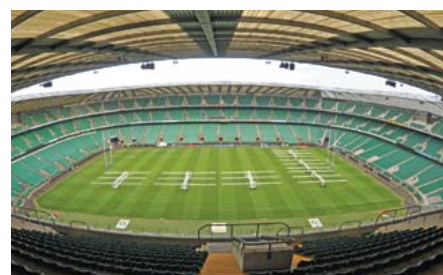
TWICKENHAM STADIUM UPGRADE UNDERWAY