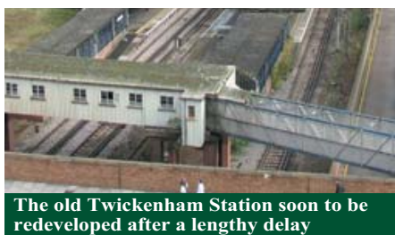
The old Twickenham Station soon to be redeveloped after a lengthy delay

Richmond Council will work with Solum to mitigate the impact of the building work on station neighbours and the travelling public.