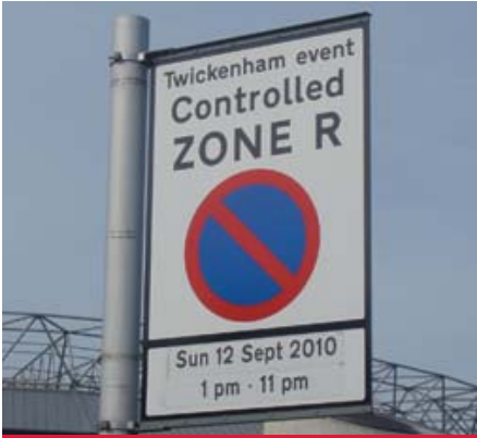
Signs around the stadium show details of when event day parking controls are next in operation

The Event Day Controlled Parking Zone (Zone R) is operated by the London Boroughs of Richmond upon Thames and Hounslow.