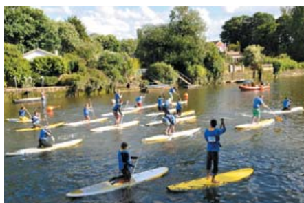
Twickenham Alive Riverside Jubilee Festival