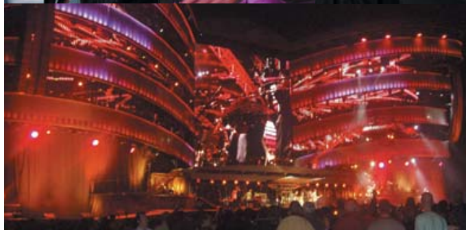
Previous concerts have included The Rolling Stones, U2, Eagles, Bon Jovi, Rod Stewart, The Police, REM, Genesis, Iron Maiden, Help for Heroes featuring Robbie Williams with Gary Barlow and Lady Gaga.