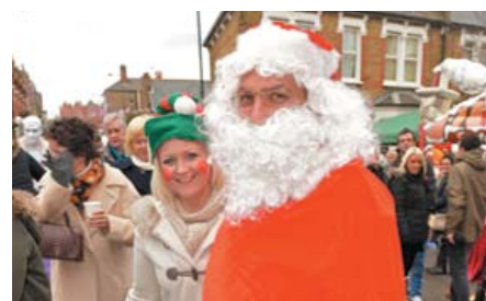
SUPPORTING FESTIVE FUN IN OUR LOCAL COMMUNITIES