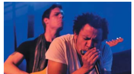
The Yardbirds Live Room Twickenham 2011