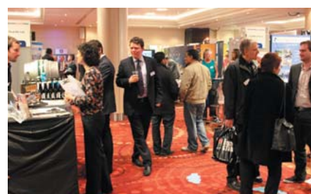
RICHMOND BUSINESS EXPO AT TWICKENHAM STADIUM

RESIDENTS' BALLOT FOR DISCOUNTED TICKETS TO RIHANNA CONCERTS PAGE 3