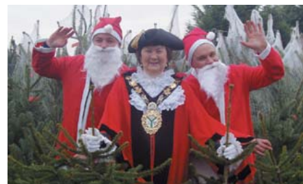
£5,500 FROM CHRISTMAS TREE SALES TO LOCAL CAUSES